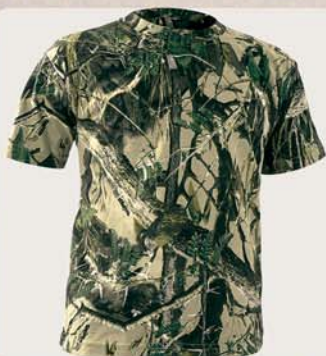
KIDS T-SHIRT K12