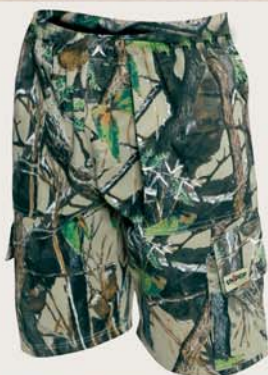
KIDS SHORTS K10