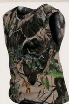
KIDS VEST K2