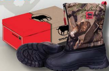
EXPLORER KIDS BOOT