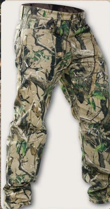
PH 5 POCKET JEANS