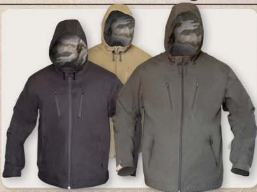
WARRIOR JACKET TJ2