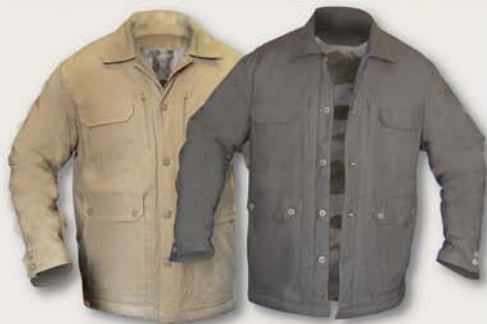
PATROL JACKET TJ1