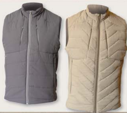
COVERT WAISTCOAT TW1