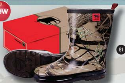
MUD MASTER KIDS BOOT