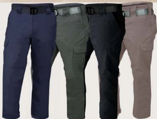
COVERT PANTS TT2