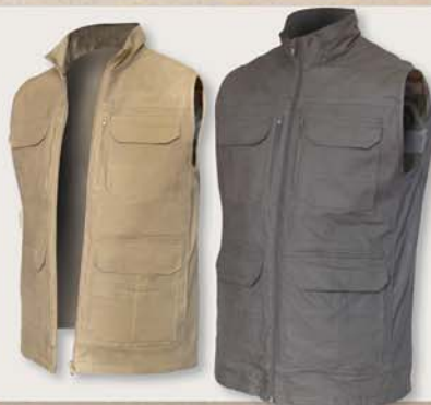
RANGER WAISTCOAT TW2