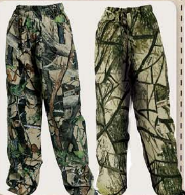
KIDS TROUSER K8