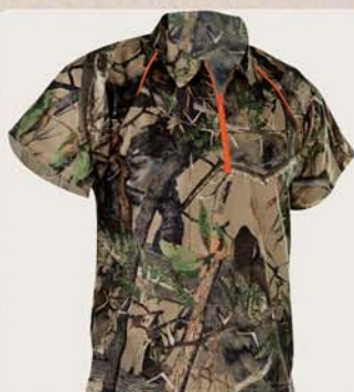
KIDS HONEYCOMB T-SHIRT K3