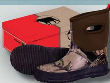
ADVENTURER KIDS BOOT