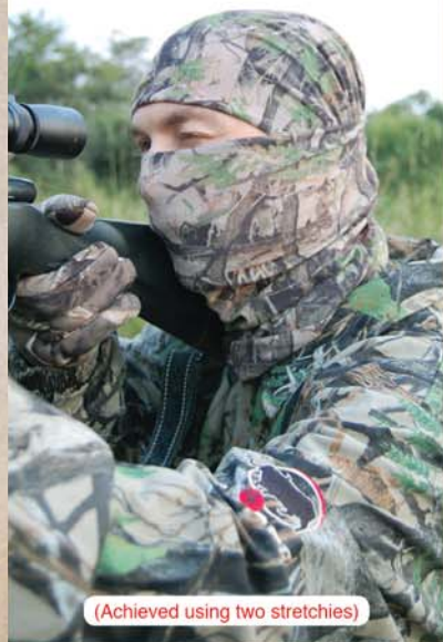
(Achieved using two stretchies)