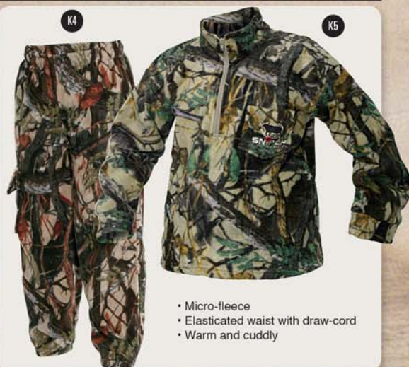
KIDS FLEECE SWEATER & PANTS