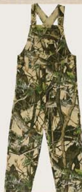
KIDS DUNGAREE K14